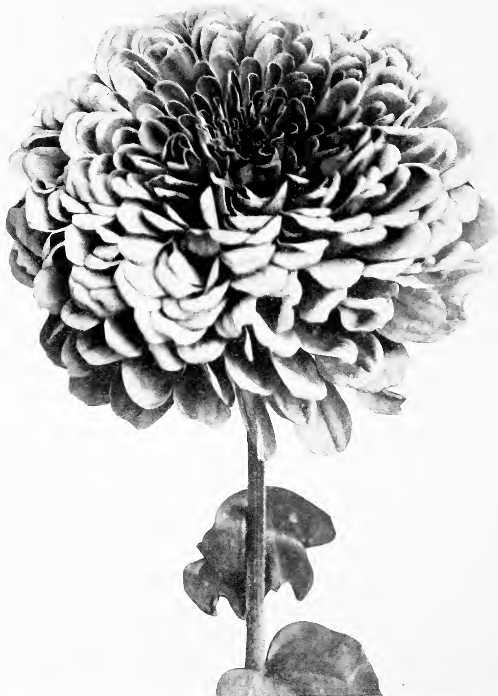
ZINNIA, DAHLIA FLOWERED ORIOLE